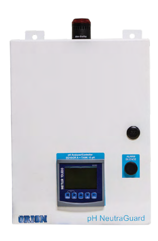
NGIII Monitor & Probe